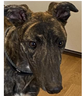
Nacho (1 of the triplets) is a brindle male fostered by Keith Warner