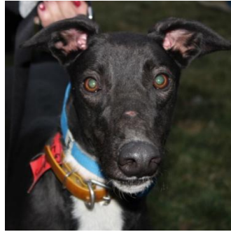
Lost My Soul (Soul) is a black male fostered by Gail Phelps