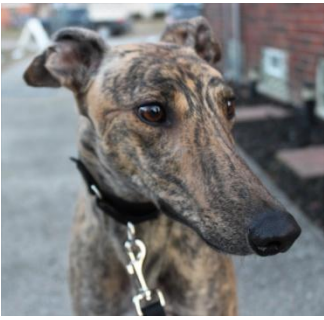
WW Bam (Bam) is a red brindle male fostered by Erin Ropposch