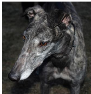
Pat C Vanry (Vanry) is a brindle female fostered by Tracey Coykendall