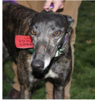
GS Kandis Lynn (Kandis) is a brindle female fostered by Connor Kress