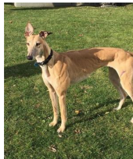
Grean Street (Duchess) is a fawn female fostered by Ed & Anna Pietrzak