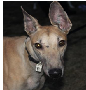
Atascocita Vroom (Vroom) is a red male fostered by Josh Scheels