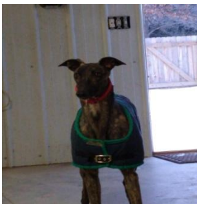
Nancy (1 of the triplets) is a brindle female fostered by Yvonne Warner