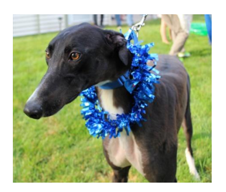
CET Bolt (Bolt) is a black male fostered by Andris Zukovs