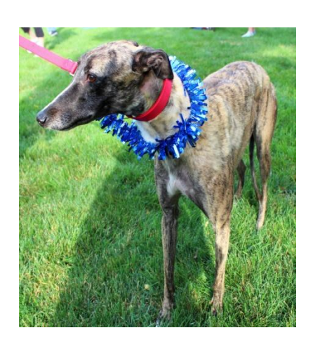
Luna is a brindle female fostered by Larry Bonsall