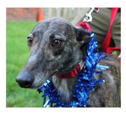
Blazing Natalie (Natalie) is a brindle female fostered by Connor Kress