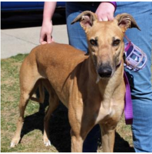
Pat C In Tune (Tune) is a red female fostered by Josh Scheels