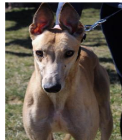
GM Work of Art (Art) is a red male fostered by Dave Biliti