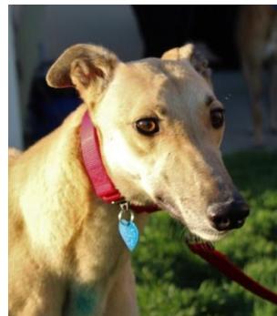
Veronica is a fawn female fostered by Greg Larson