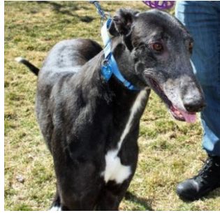
BL Alvin (Alvin) is a black male fostered by Carrie Rimar