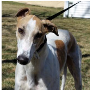
Lazy Days Dodger (Dodger) is a white & brindle male fostered by Zach Mayfield