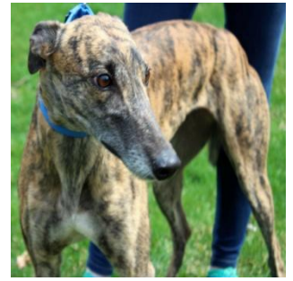
Barts Ocean (Presley) is a 3 yr old brindle female Fostered by: Erin Ropposch