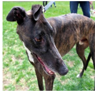
Big Hurraican (Hurraican) is a 3 yr old dark brindle male Fostered by: Keith Warner