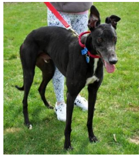
AMF Last Word (Brat) is a 4 yr old black male Fostered by: Sandi Shalhoub