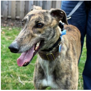
Barts Razorsharp (Candy) is a 3 ½ yr old red brindle female Fostered by: Codilyn Johnston