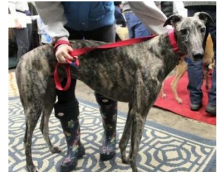
RML Congo (Congo) is a 2 yr old brindle male Fostered by: Sandi Shalhoub Adopted by: Shane Redinger