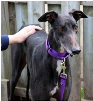
TNT Coco Loco (Coco) is a 3 yr old black female Fostered by: Savannah Schaeffer