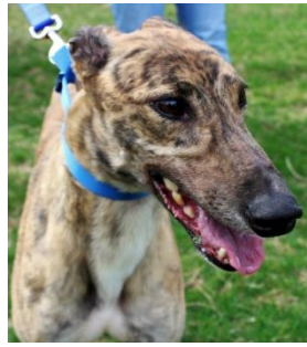
Peppy Chela (Chela) is a 5 yr old brindle female Fostered by: Cynthia Brodoski