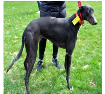
WW Wallop (Wally) is a 2 yr old black male Fostered by: Katie Kono