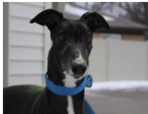
PRM Twilight (Twilight) is a 3 yr old black female Fostered by: Jim Allure Adopted by: Danielle Sims