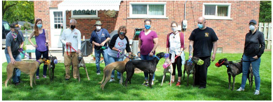
CTW Kupcake (Kupcake) is dark red brindle female fostered by Wendy Allen