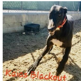
Kaias Blackout (Lafayette) is a black male fostered by Scott Prior