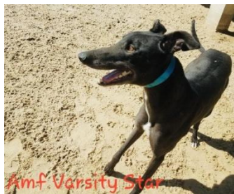
AMF Varsity Star (Star) is a black male fostered by Vanessa Rowan