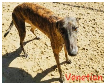
Venetian (Natty) is a brindle female fostered by Erin Ropes