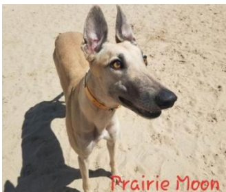
Prairie Moon (Kapi) is a light fawn female fostered by Stephanie Roth

Hopefully, our next haul will be back to normal !!