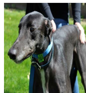
Superior Shrike (Ike) is a black male fostered by Scott Prior