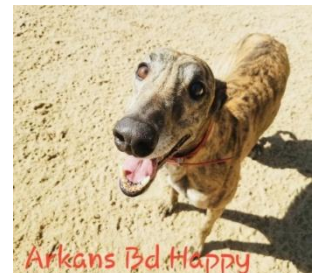
Arkans Bd Happy (Happy) is a brindle female fostered by Dawn Bomay