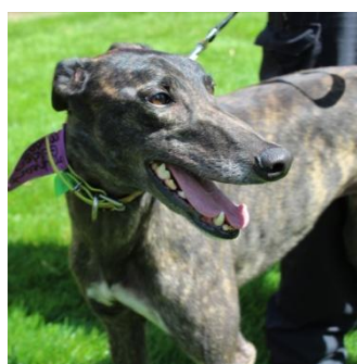
Golden Midas (Midas) is a dark brindle female fostered by Amy Hensley