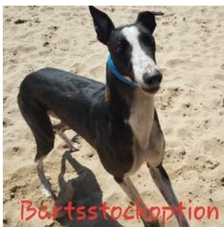
Bartsstockoption (Wally) is a black & white male fostered by Yvonne Warner