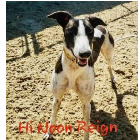
Hi Noon Reign (Reign) is a cow dog female fostered by Chris Sytek