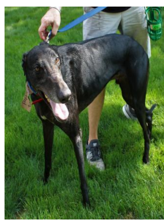
WW's Snowbird is a 5 yr old black male. Fostered by: Keith Warner