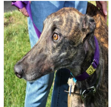
SH Prism is a 2 yr old brindle male. Fostered by and adopted by: Diane Riordan