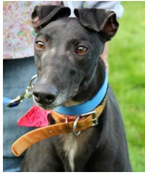
PJ Losin Control (Lolo) is a black female fostered by Jeff Henkel