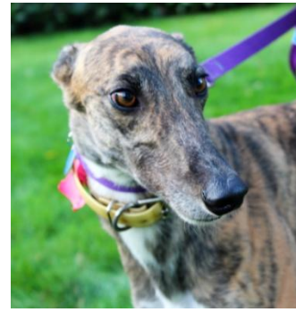
Flying T Elsey (Kelsey) is a brindle female fostered by Linda Santo