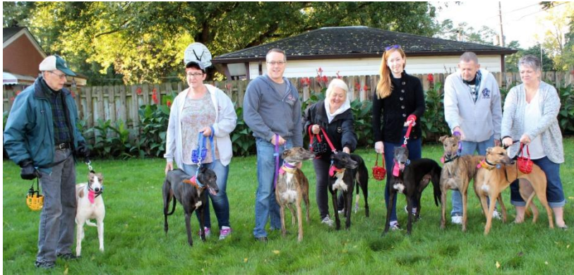
Volunteers, Adopters & Fosters