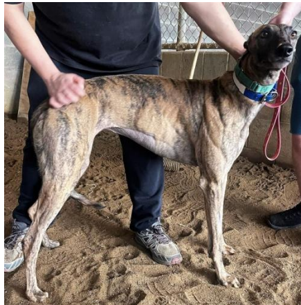
Risk Everything (Risky) is a brindle female being fostered to adopt by Dave Patterson