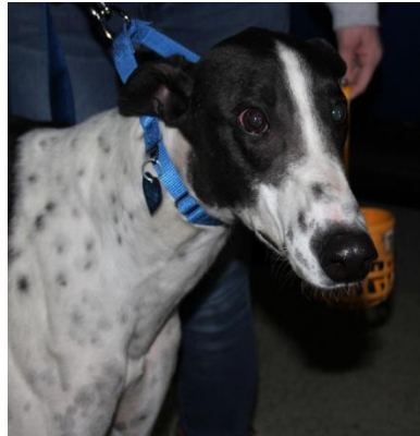
Tap Out is a white & black male fostered by Yvonne Warner