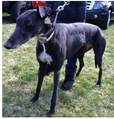
FGF Friendly Gal (Gal) is a black female fostered by Erin Ropes