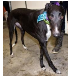
Black Silk (Silky) is a black female fostered by Dave Biliti & Sarah