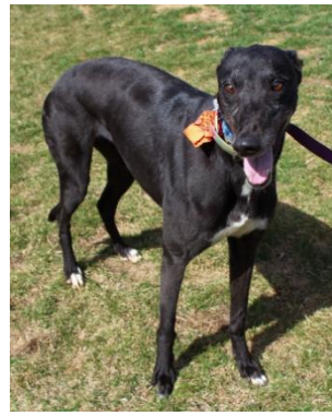
Black Coral (Reggie) is a black female fostered by Vanessa Rowan