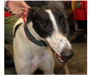
AJN Tower of Power (Tower) is a white & black male fostered by Yvonne Warner