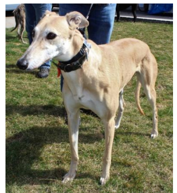
Atascocita Bash (Bash) is a red female fostered by Robin Wittner