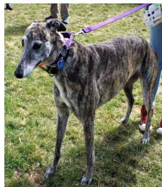
Go Go Morocco (Morocco) is a brindle female fostered by Melanie Silva