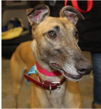
JS Glo Getter (Giddy) is a red fawn female fostered by Amy Dunlap