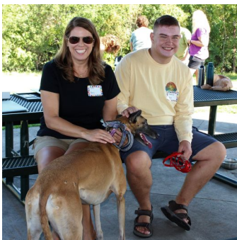
1 st place – Boo