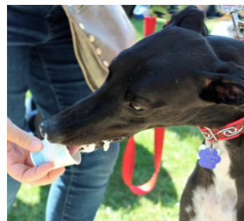
2 nd place – Solo