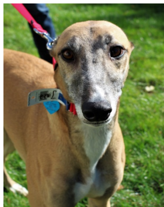
Oshkosh Jazz (Jazz) is a red female fostered by Corey & Erin Gipperich