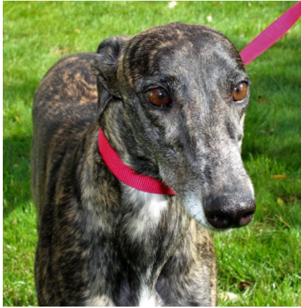
Lil Bit is a brindle female fostered by Yvonne Warner