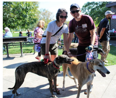
1 st place – Big Tuna on the right (68 ½”)