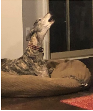
1 st place – Katy