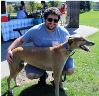
1 st place – Boss (54 ½”)