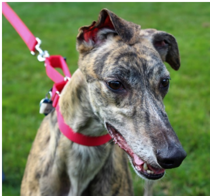
Ey Livy is a red brindle female fostered by Connie Schmidt