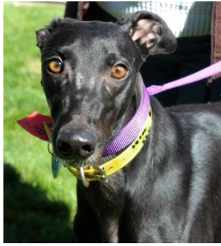
Arroyo Bree (Bree) is a black female fostered by Jeff Henkel