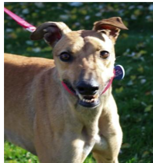
RT's Tami Lou (Tami) is a red fawn female fostered by Rachel Giles