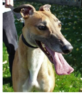
WW Avaricious (Ava) is a red fawn female fostered by Dave Biliti