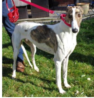
Water is the Key (Key) is a white & brindle female fostered by Zach Mayfield.