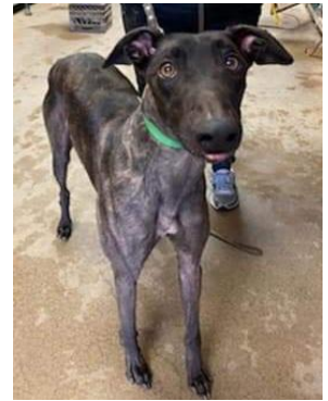
Aussie Trouble (Aussie) is a dark brindle male fostered by Vanessa Rowan (brought in from W VA)