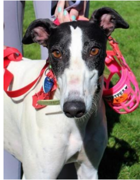
Hilco Sweepa (Sweetpea) is a white/black cow dog fostered by Codilyn Johnston