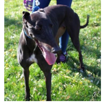
BL Delilah (Delilah) is a black female fostered by Erin Ropposch