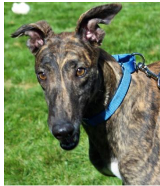
WW Irises (Iris) is a dark brindle female fostered by Robin Wittner