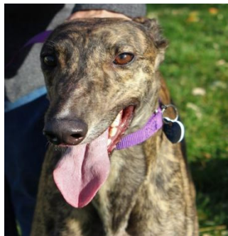
WW Katara (Katara) is a brindle female fostered by Monique LaBenne