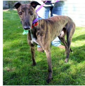
Ray (Fureys Gold) is a 3 yr old brindle male Fostered by: Sandi Shalhoub