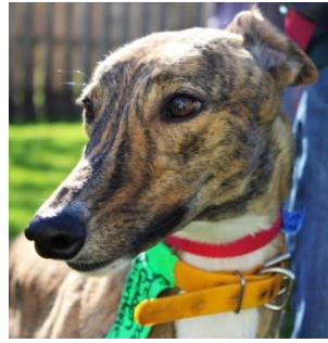
Golden Advantage is a 2 ½ yr old brindle female Fostered by: Carol Gilin