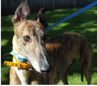
TJ (TJ Hooker) is a 4 yr old brindle male Fostered by: Omar Khali