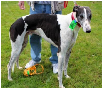
Alex (Jackpot Alex) is a 4 yr old male black & white cow dog Fostered by: Cliff LaTour