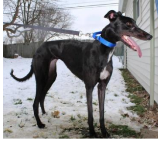
Fred Flintstone (Freddie) is a black male fostered by Chris Sytek