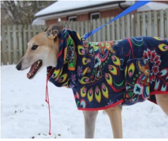
High Noon Wiggle (Wiggle) is a red female fostered by Diane Manko-Cliff