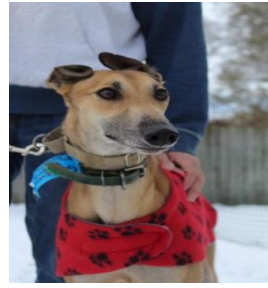
Wilma Flintstone (Wilma) is a fawn female fostered by Vanessa Rowan