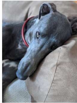
Barts Ooh Rah (Toby) is a blue male fostered by Art & Assi Zylka