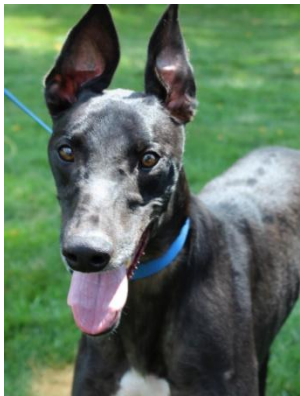
PJ Bounce Back (Jerald) is a black male fostered by Karen Deren