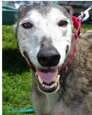
Pat C Deception (Dee) is a brindle female fostered by Jeff Henkel