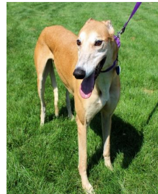
That Away (Wendy) is a fawn female fostered by Sally West