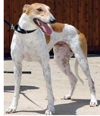
Loco Camero (Bolt) is a male cow dog fostered by Scott Prior (brought in on 8/6)