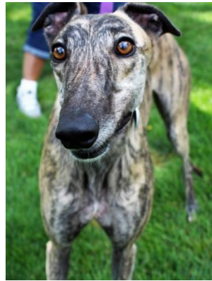
Amazing Arleen (Arleen) is a brindle female fostered by Vanessa Rowan