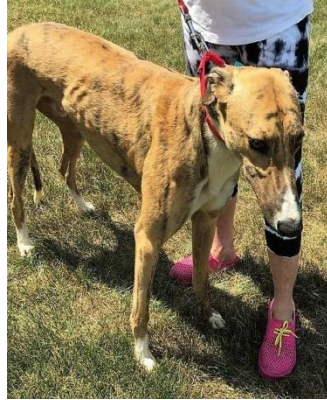
Cimarron City (Aiden) is a brindle male fostered by Yvonne Warner